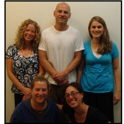
Day One Homeless Youth Program Counselors

For more information about all Day One programs, go to www.day-one.org .