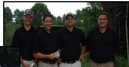
Members of the Key Bank Team